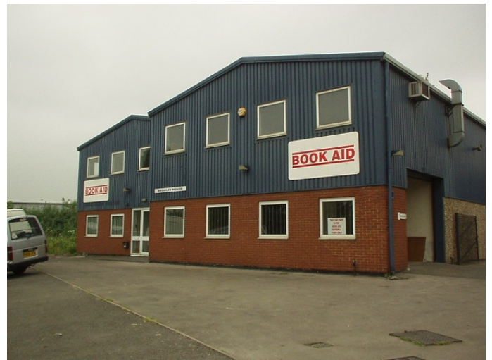
BROMLEY HOUSE: The new Book Aid premises in Sydenham, London SE25