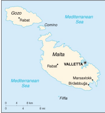
Map from Operation World CD-Rom.

Ask of Me, and I will give You the nations for your inheritance, and the ends of the earth for Your possession Psalm 2.8