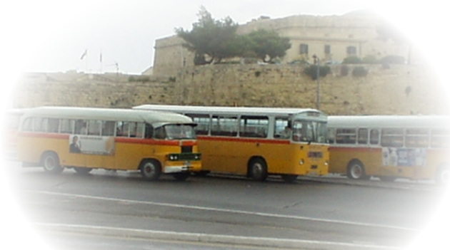
Yellow Maltese buses