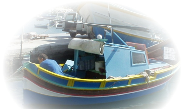
Maltese Fishing Boat