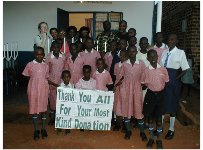
UGANDA: These children from Kidcare received a donation of Book Aid books