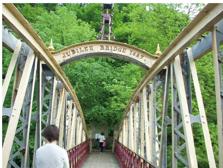
Crossing over into Jubilee - Jubilee Bridge, Matlock Bath, Derbyshire

The crowning feature of Jubilee Year was the full restitution of all property, land and houses. This had the benefit of restoring to each family their inheritance and re-established the division and