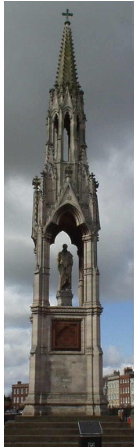
Thomas Clarkson (1760-1846)