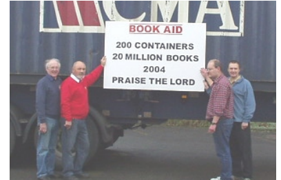
Rejoicing as container No.200 leaves Ranskill for Barbados