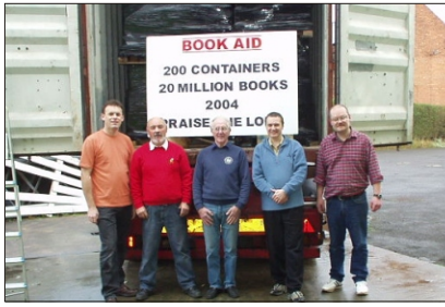
Milestone: 200 Containers, 20 million books